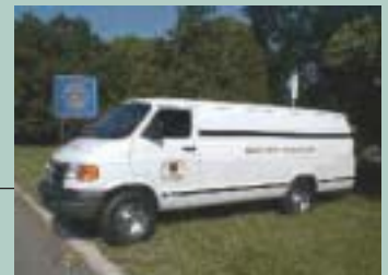
Passaic County Department of Health Air Monitoring Van.